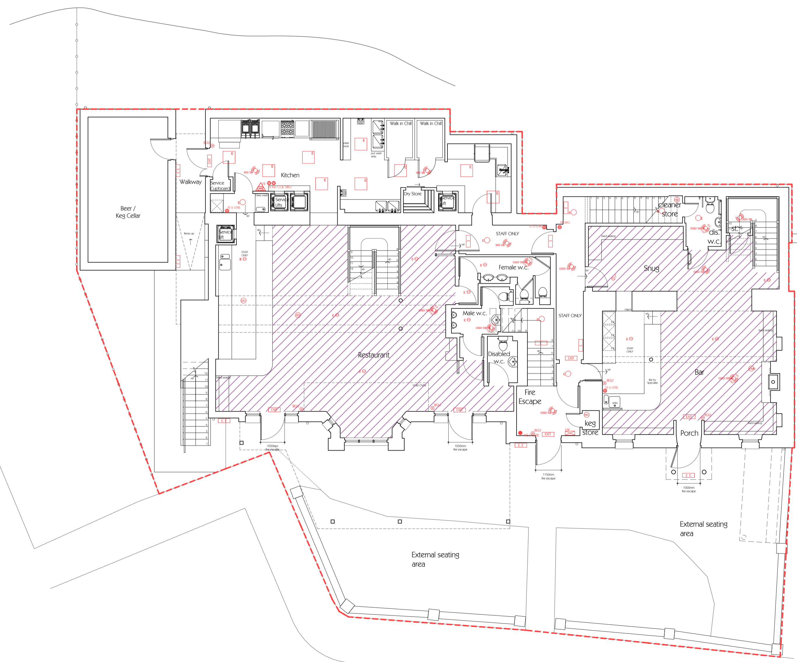
GROUND FLOOR PLAN 1:100